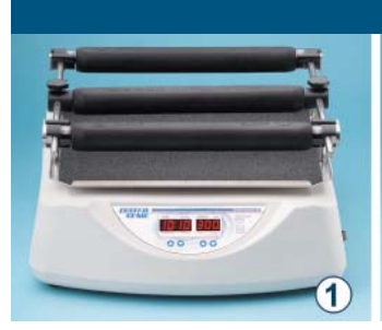
1. Orbital-Genie With Universal Ratcheting Clamps provides the flexibility for using a mix of different size and shape vessels on a single platform. Unit is supplied with two ratcheting and one non-ratcheting cushioned clamps. Extra ratcheting clamps for more than two rows of smaller vessels are optional.